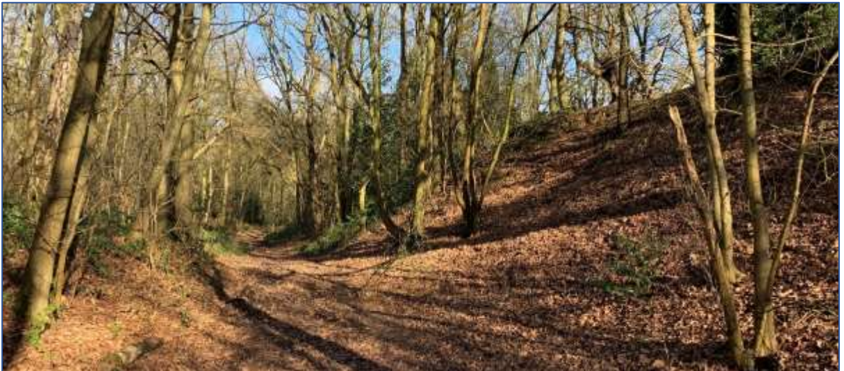
Wollaston Dyke in the Ridge Wood