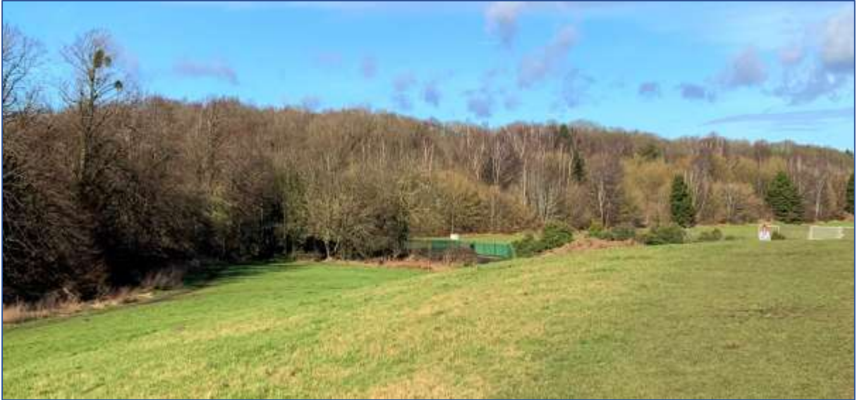
Ridge Wood from Stourbridge side along side the school playing fields