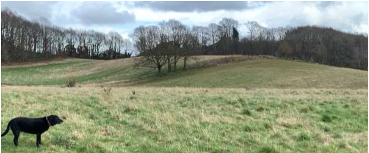
Looking across the fields towards Friar's Gorse wood