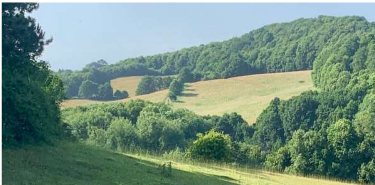
Friar's Gorse fields in middle distance with woods beyond