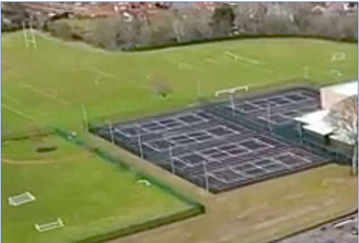
The area is in the middle distance