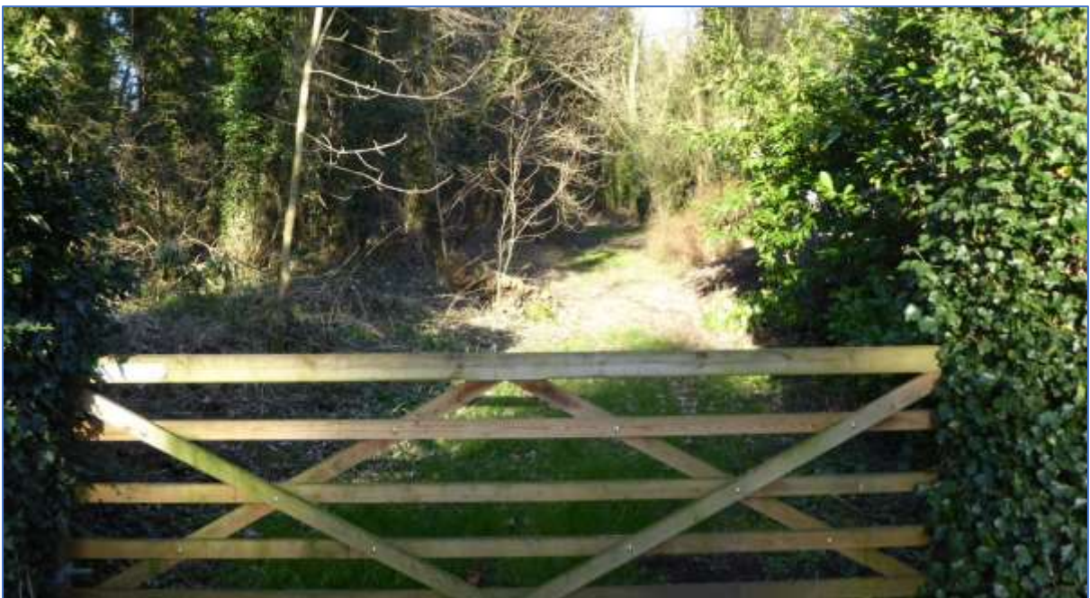
Former light railway course, here seen from the Hyde access track, near the canal