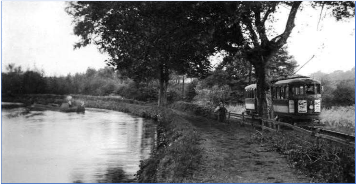
Kinver Light Railway