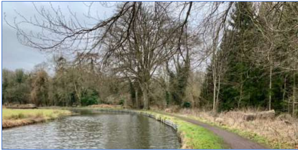
The site borders the canal towpath